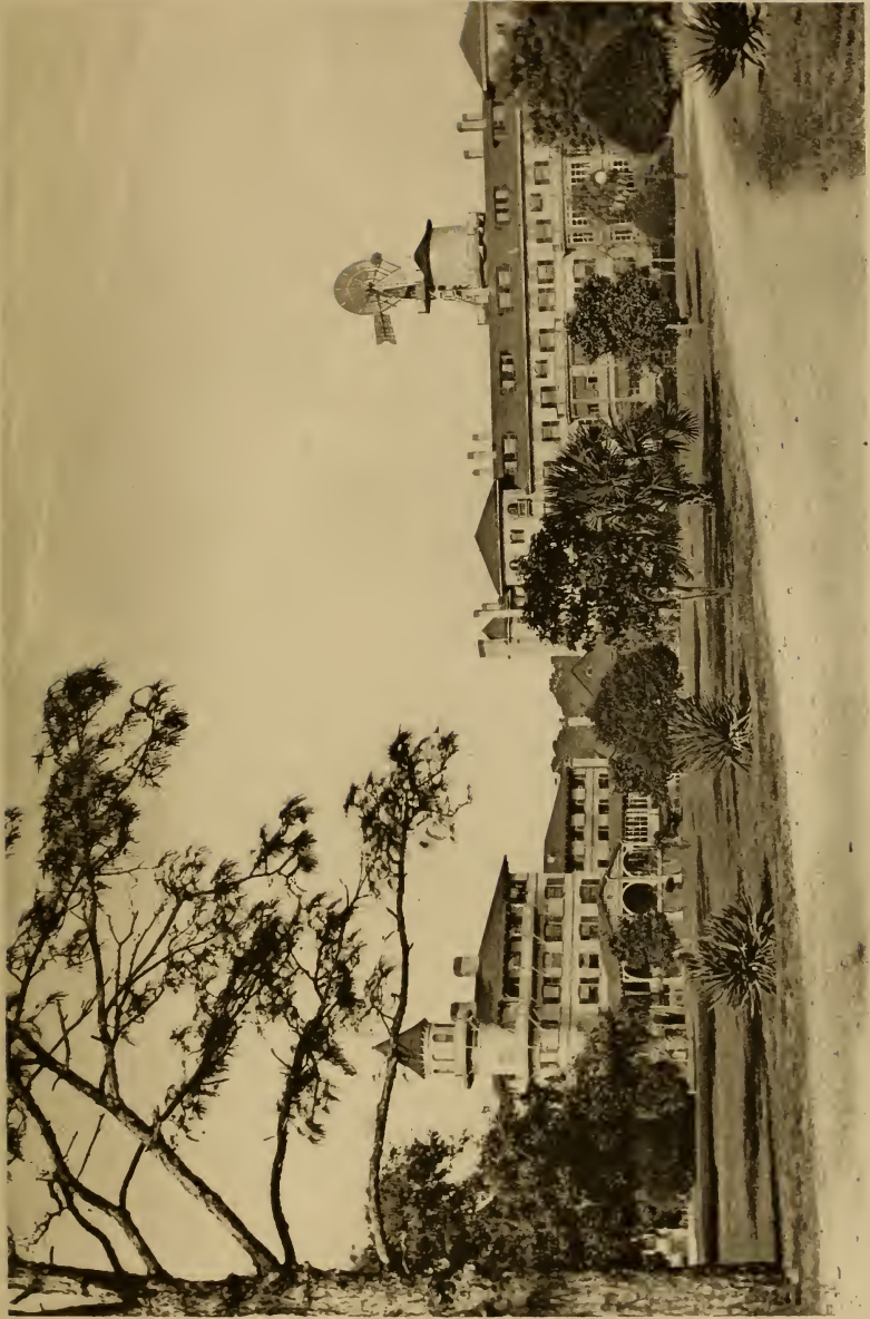
CLUB HOUSE AND APARTMENT HOUSE